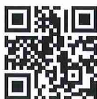
Salford Parent Carer Forum

Salford Parent Carer Forum: Offer a range of groups and drop-ins for parent carers. You can access their website https://salfordpcf.com/