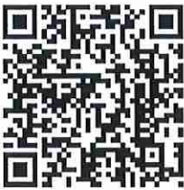
Autism Salford Kids Squad

Autism Salford Kids Squad: Autism Salford kids squad (A.S.K.S) | Facebook https://www.facebook.com/groups/1384327398792112/?ref=share_group_link