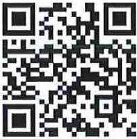
I Am Autism

I Am Autism: Home - I AM (i-am-autism.org.uk)