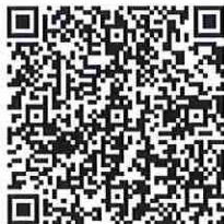
Salford Neurodevelopmental Support Survey

The survey you will prompt you to provide an email address for us to contact you if you would like to be kept updated of any developments made on the support offer. We want to make the system work for you.